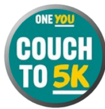
COUCH TO 5K