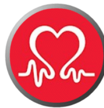
BRITISH HEART FOUNDATION